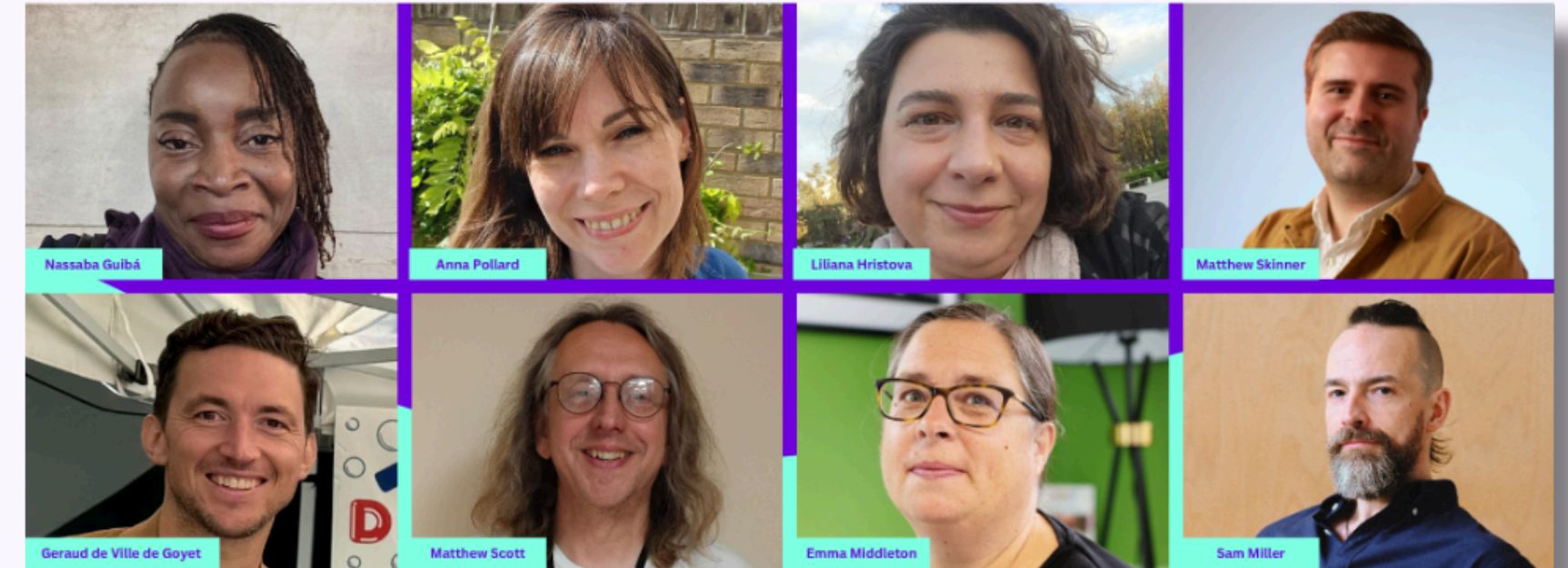
Working Group members